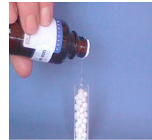
Preparing Homeopathic pilules

Drops & pilules have same therapeutic effects