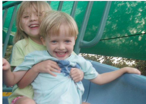
MINDD Albury 23rd August 08