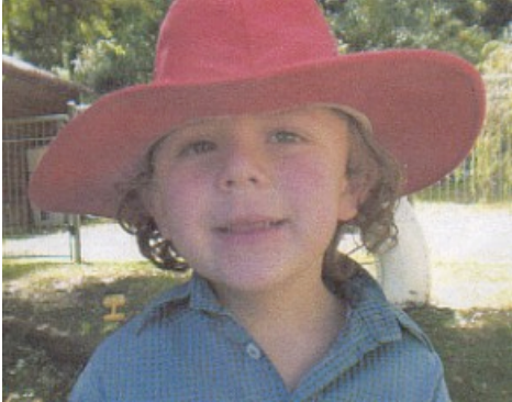
MINDD Albury 23rd August 08