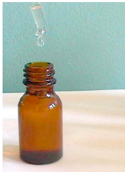
Homeopathic drops being prepared for children MINDD Albury 23rd August 08

Drops & pilules have same therapeutic effects